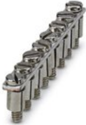
Fixed bridge, pitch: 4 mm, number of positions: 8, color: silver

Please be informed that the data shown in this PDF Document is generated from our Online Catalog. Please find the complete data in the user's documentation. Our General Terms of Use for Downloads are valid ( http://phoenixcontact.com/download )